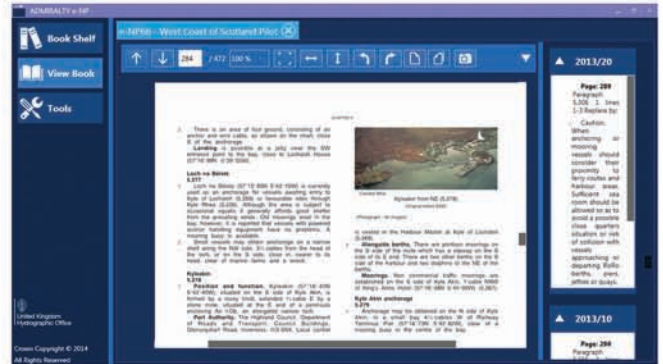
Sailing Directions e-NP

Carriage compliance - e-NPs are designed to meet SOLAS carriage requirements, contain the same official information as their paper equivalents, and have been approved by the Flag States of over three quarters of ships trading internationally.