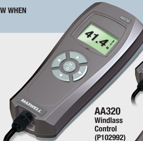
AA730 With Rodecounter (P102944)