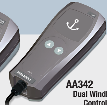
AA342 Dual Windlass Control (P102996)