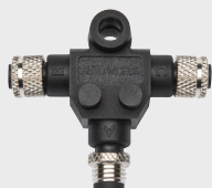
Dual Installation T Connector (SP4155)