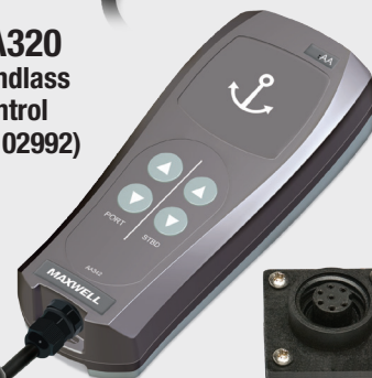
AA320 Windlass Control (P102992)