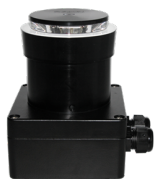
HL55-P LED-Perimeter light surface on connection box